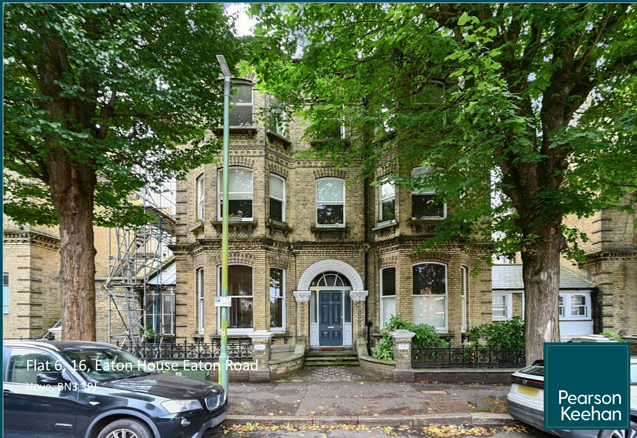
Flat 6, 16, Eaton House Eaton Road Hove, BN3 3PJ